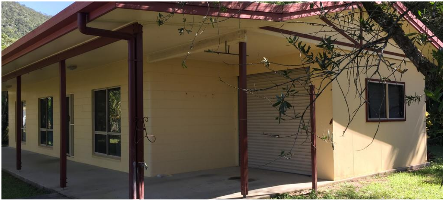
11 Pease Street, Tully